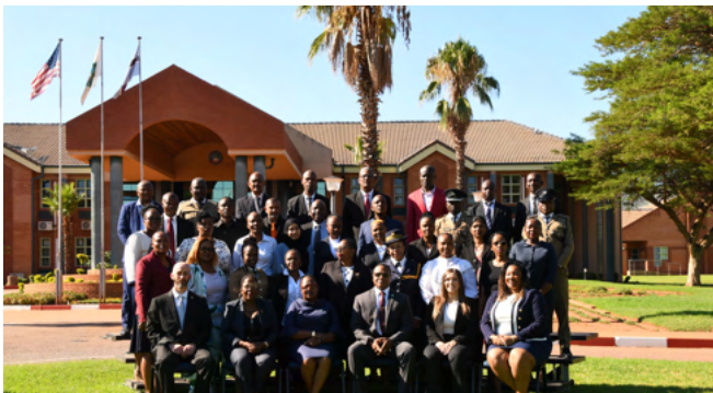
January, Trafficking in Persons