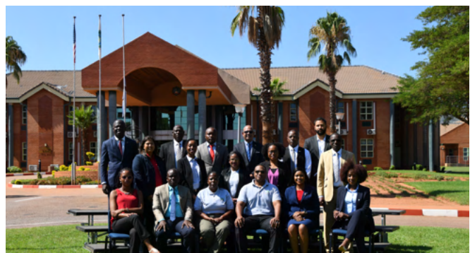
Point of Contact