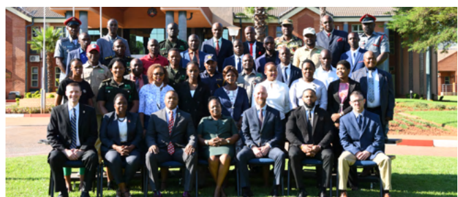
Wildlife Trafficking Investigators