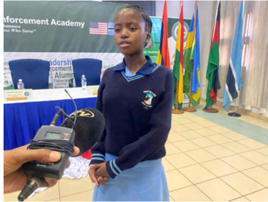
Student participant from Baratani CJSS who attended panel discussion