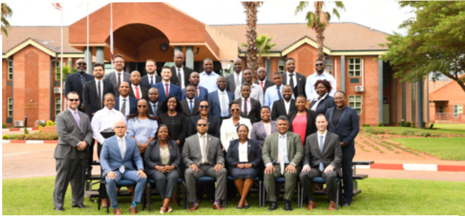
Asset Forfeiture and Money Laundering