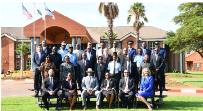
March, Advanced Narcotics Investigations