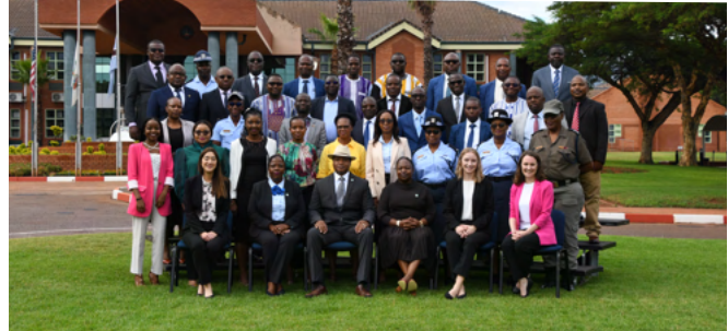
Anti-Collusion in Public Procurement