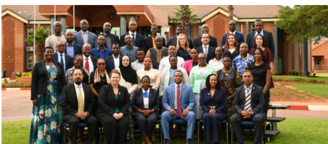
March, Trafficking in Persons