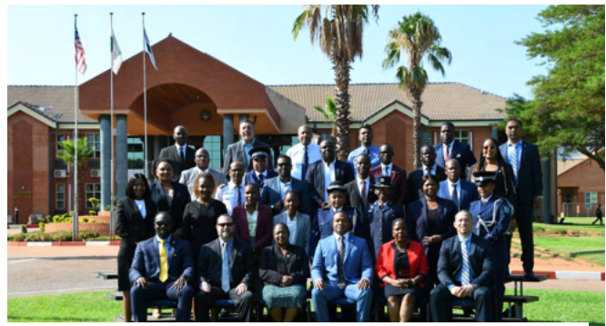
January, Advanced Narcotics Investigations