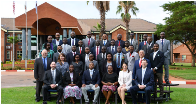
International Computer Hacking and Intellectual Property (ICHIP) Crypto Currency Working Group