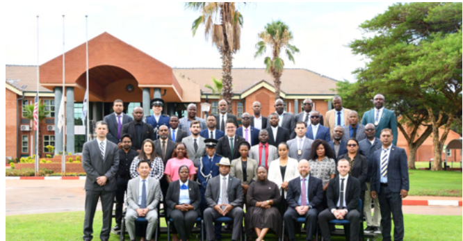
Cyber Crime Investigations